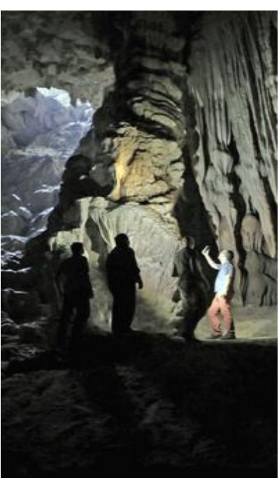
Dragon Cave is one of the most fascinating attractions in Borikhamxay Survey was province.

Better management of tourist sites in Borikhamxay province is required to improve the experience and make access more convenient for visitors, local tourism operators noted yesterday.