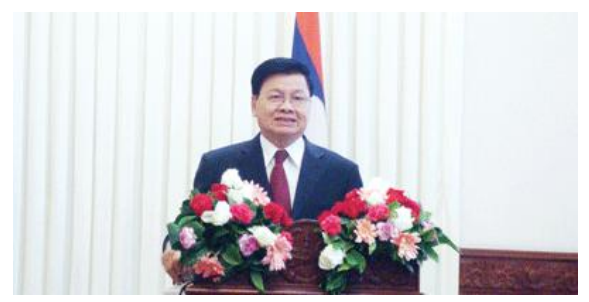
Prime Minister ThonglounSisoulith speaks to the media.

The government intends to crack down on corruption and other undesirable forms of conduct, while also tackling poverty reduction and creating sustainable ways for people to earn a living.