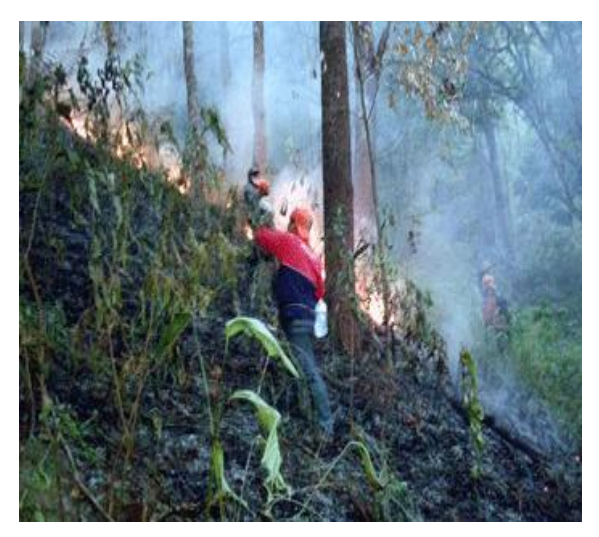
Fire fighters tackle a blaze in the Namha National Conservation Forest in Sing district, LuangNamtha province over the weekend.

Wildfires ravaged 700-800 hectares of woodland in the Namha National Conservation Forest in Sing district, LuangNamtha province, over the weekend and provincial authorities have deployed over 50 officials to help extinguish the flames.