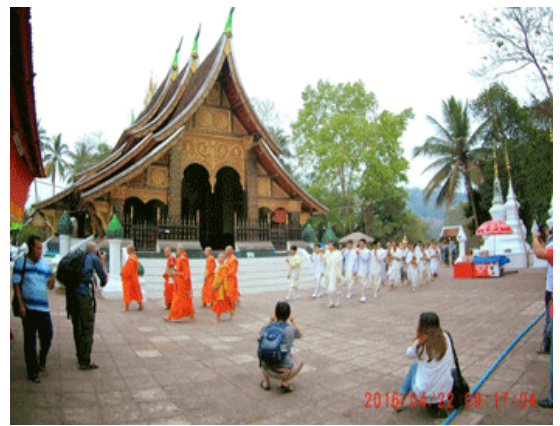
A typical Buddhist ritual in which both monks and laypeople parade around Xieng Thong temple in LuangPrabang. As usual in this town, tourists are snapping pictures of the scene.

Some 83 percent of foreign tourists who visit Laos put the world heritage town of LuangPrabang at the top of their itinerary, according to a survey of 2,800 overseas visitors conducted in 2015 by the Tourism Development Department.