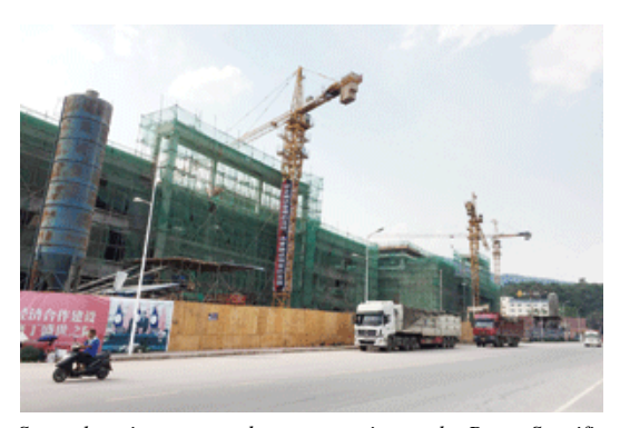
Several projects are under construction at the Boten Specific Economic Zone.

Businesses have poured more than 100 billion yuan into the Laos-China Boten-Mohan border economic cooperation zone, lured by investment incentives offered by the governments of both sides, the latest data shows. In September last year, the governments of Laos and China signed an agreement to establish the economic cooperation zone at the Boten-Mohan cross-border area, aiming to boost trade, investment and tourism in the region. Authorities in charge of the zones